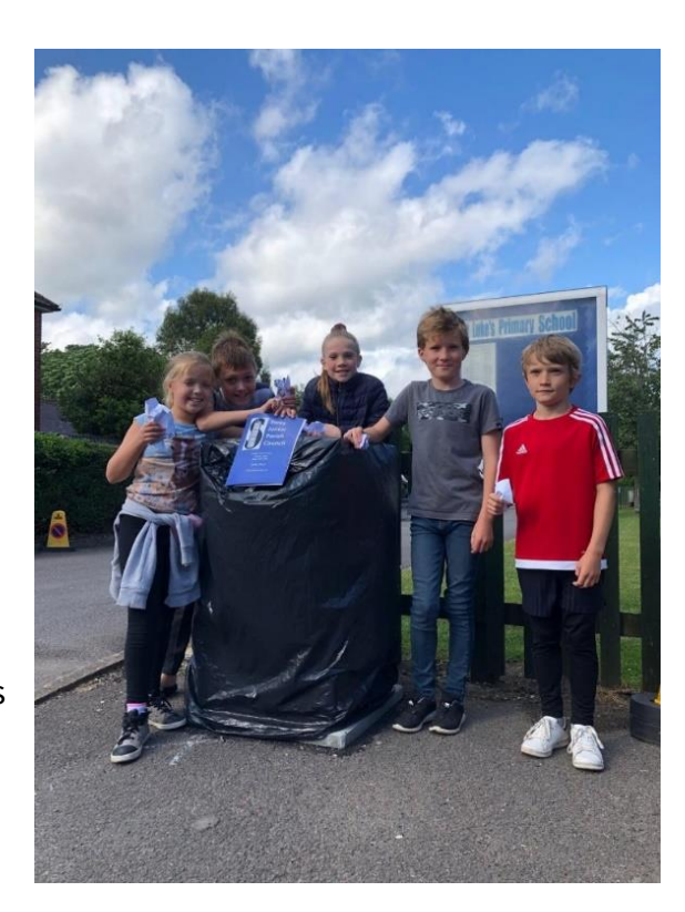
St Luke's CE Primary School, Sway Global Neighbours Gold award holders: Sway Parish Junior Councillors encourage people to pick up litter and they organised new dog litter bins to be installed in the village.