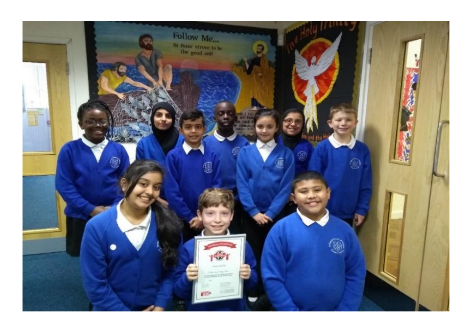
St Peter's CE Primary School, Rochdale receiving their Global Neighbours Bronze award

'What does the Lord require of you? To act justly and to love mercy and to walk humbly with your God' (Micah 6:8)