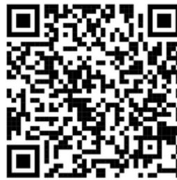
Let's Discuss: Extreme Right-Wing

Scan the QR codes to access each Let's Discuss resource.