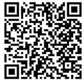
Let's Discuss: Islamist Extremism